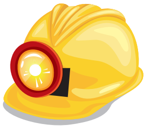
Health and Safety Manager